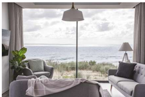
(From far left) The Dunes, where the green meets the sea; Barnbougale's Ocean Villa

As for wine-tasting, cellar doors of note include Goaty Hill, Sinapius, Jansz, Holm Oak and Delamere. Further towards Devonport, Ghost Rock has a range of crisp, balanced wines as well as platters with locally sourced produce, best enjoyed on the sun-drenched balcony.