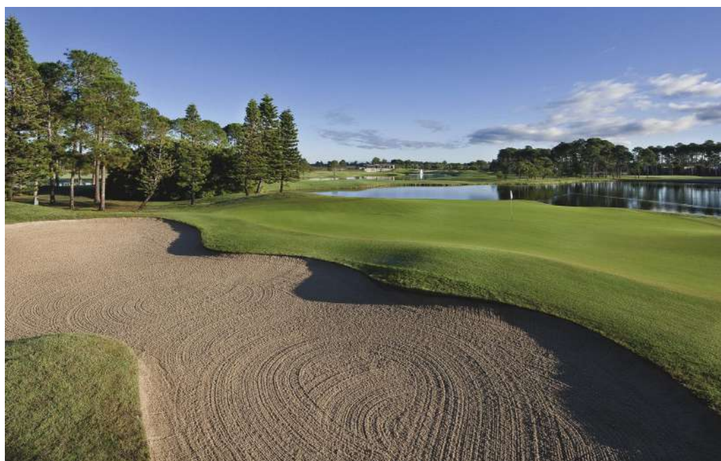
Sanctuary Cove Golf and Country Club's private course, The Pines

Rick Shores ( rickshores.com.au ) in Burleigh Heads is the eatery du jour. Why? It's a tie between the drool-worthy fried Moreton Bay bug roll and the phenomenal views. For sharing feasts, Social Eating House + Bar ( socialeatinghouse.com.au ) in Broadbeach is your go-to, while The Collective ( thecollectivepalmbeach.com.au ) in Palm Beach offers a modern take on the food-hall concept. Tuck into brunch-ish staples at The Paddock Bakery ( paddockbakery.com ) in Miami or head to sister site Bam Bam Bakehouse ( bambambakehouse.com ) in Mermaid Beach for the best baked goodies on the Coast. Japanese restaurant Kiyomi at The Star Gold Coast ( hotel.qantas.com.au/stargoldcoast ) – the $850 million reincarnation of Jupiters – takes care of that special night out. Don't leave without ordering the crisp rice with spicy tuna and the Wagyu tenderloin with wasabi butter.